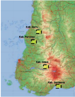
Indicative Location in South Sulawesi

LOCATION: Barru Regency/Pangkep Regency (Indicative)